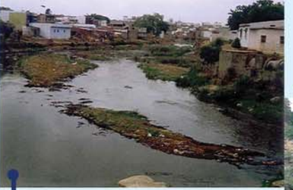
Pollution Concentration in Surplus Nala downstream of H.S.Lake

The HMWSSB (Hyderabad Metropolitan Water Supply and Sewerage Board) was constituted with the functions & responsibilities in the Hyderabad Metropolitan Area are water supply Sewerage Disposal & treatment works including planning, design, construction, maintenance, operation & management of all PSs & TPs.